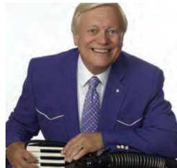
Walter Ostanek Canada's Polka King