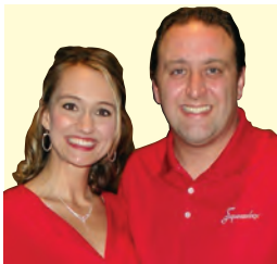
Mollie B, Ted Lange & Squeezebox